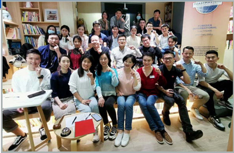
Members of Foresea Toastmasters International Club, in Shenzhen City, Guangdong, China, celebrate their club.