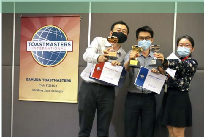
Speech contest winners of the Gamuda Toastmasters Club, in Petaling Jaya, Selangor, Malaysia, receive trophies and certificates.