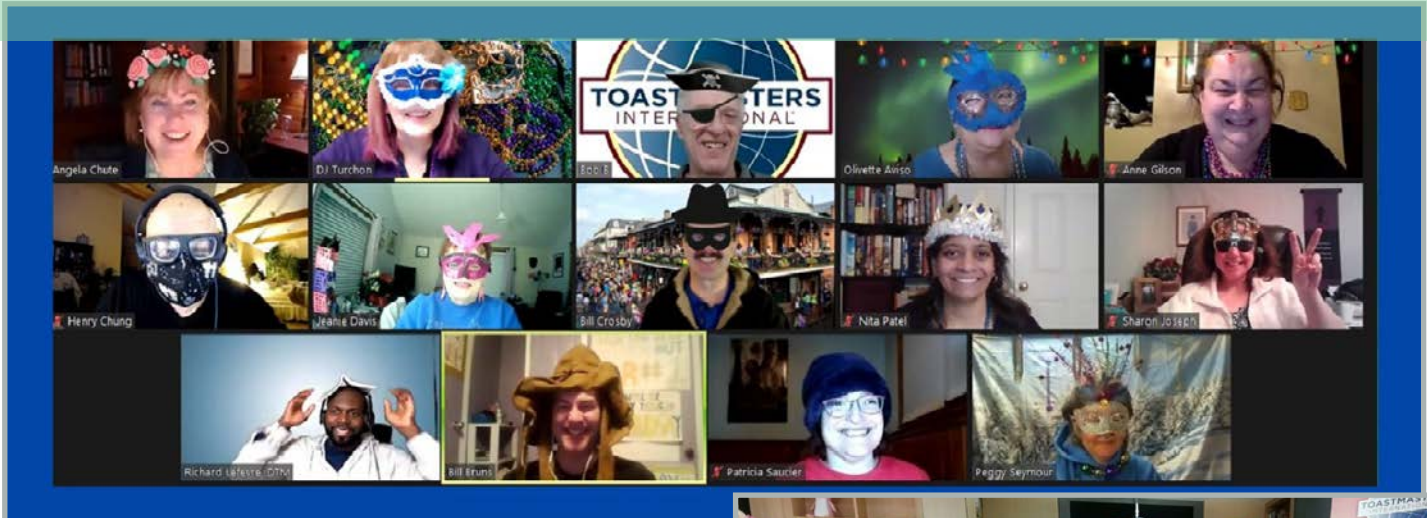
The Maine Thing Advanced Toastmasters Club, in Augusta, Maine, celebrates Mardi Gras with a themed meeting.

It's important to foster a sense of family, she says—"show people that they care. When I first went to Alpha 289, I was impressed by how much it felt like a family."