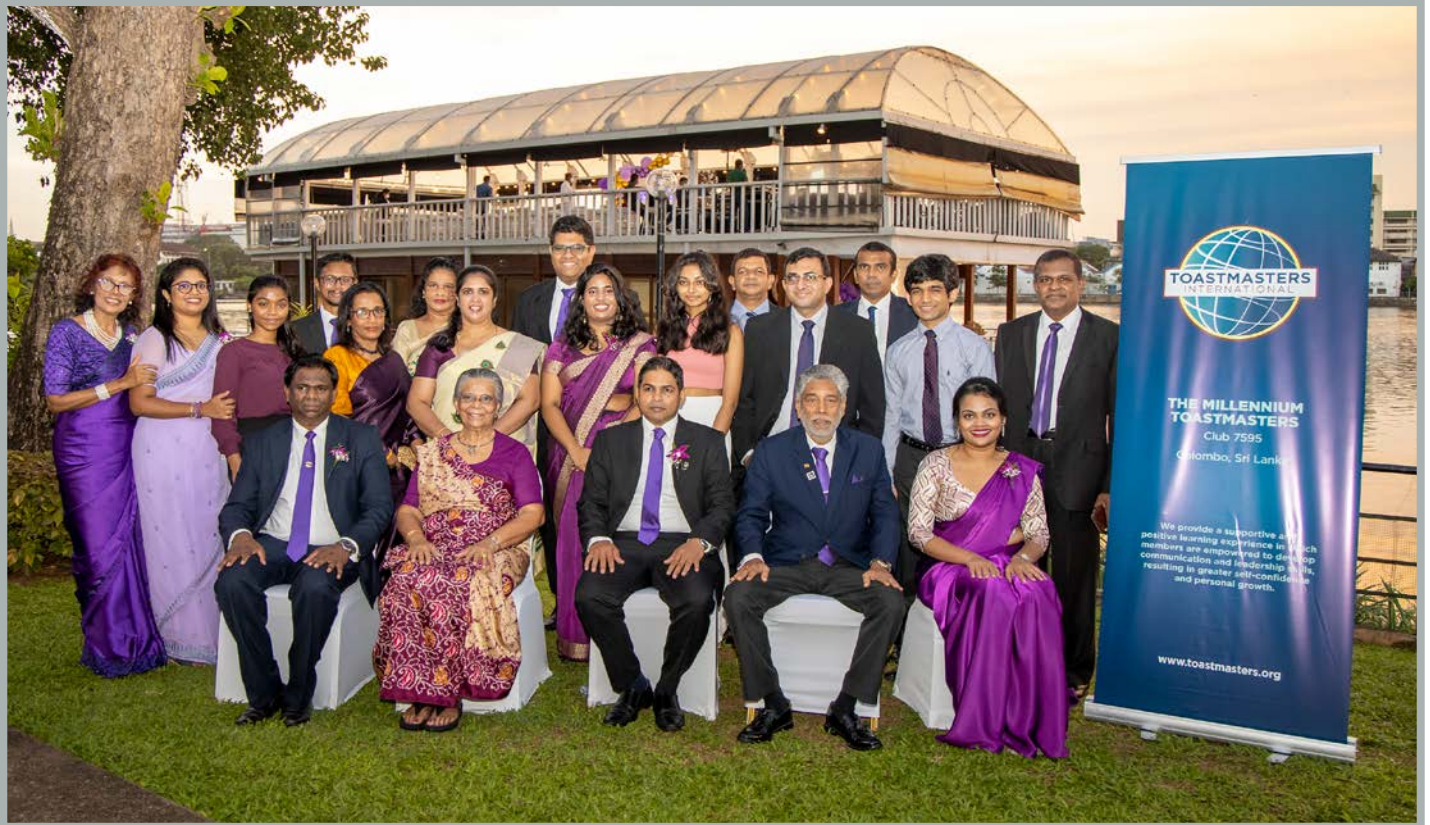
Members of The Millennium Toastmasters Club of Colombo, Sri Lanka, celebrated their officer installation in November 2021. The group boarded a floating restaurant on a boat for the evening but posed for this photo before setting sail.