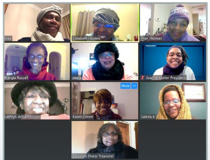
Members of Wadsworth Center Toastmasters, in Detroit, Michigan, host a winter-themed meeting.