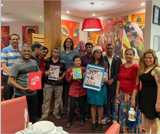
Members of EPPING CLUB of Epping, Victoria, Australia, enjoy a holiday dinner and printouts of the Toastmaster magazine.